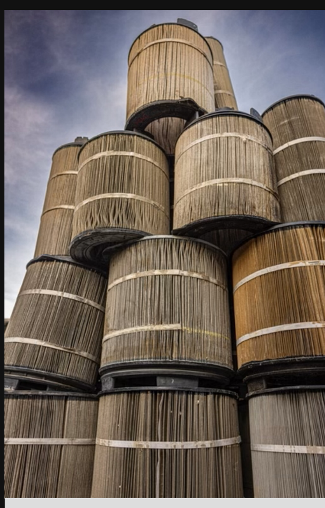
We've been stacking discarded cartridges at our shop as we replace them with sand filters, which I believe work much better in maintaining high-quality water.