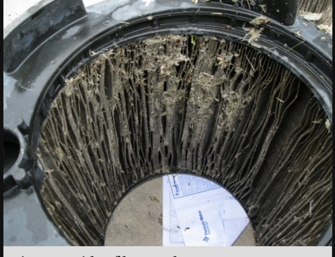
Dirty cartridge filters only serve to re-contaminate water, making service far more difficult, while putting bathers at risk.

The unfortunate fact is many builders don't know how to manage chemistry; and, as a result, their pools aren't properly set up for ongoing maintenance. Instead, the cartridge filter comes to the rescue and for a time, seems like a cure all. The challenge is that our industry has become so habituated by all the marketing that we don't realize the problem is the filter itself.